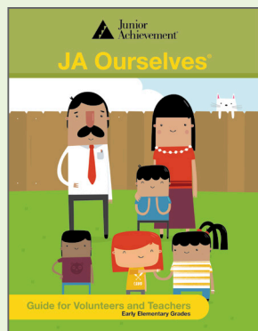
Guide for Volunteers and Teachers