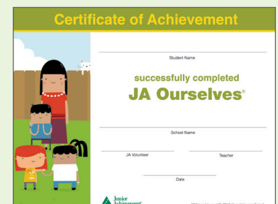
Certificates of Achievement